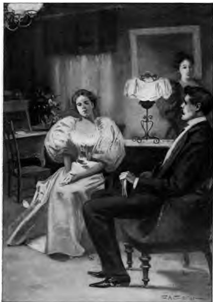
She was beautiful in her evening dress.—Page 255